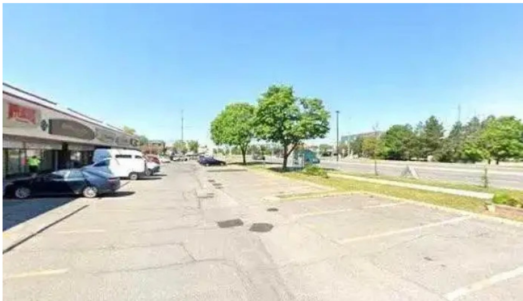
Adm ottawa physiotherapy bells corners street view 360deg