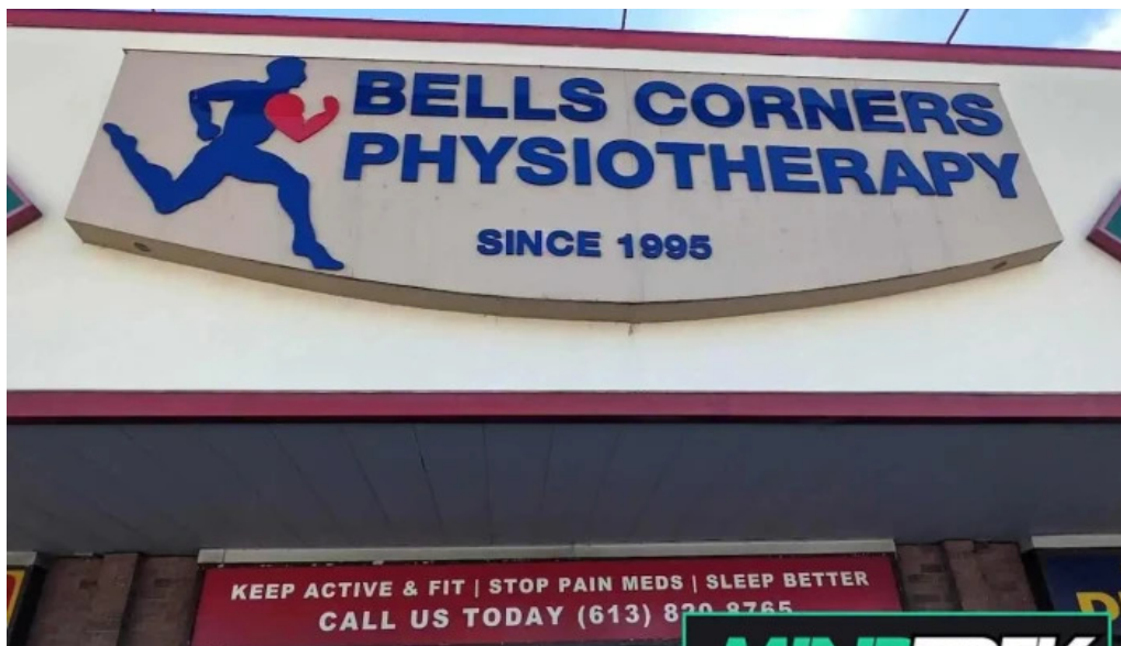
Adm ottawa physiotherapy bells corners nepean