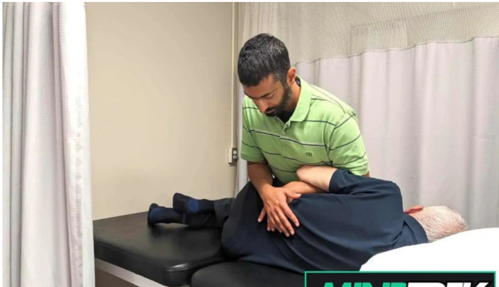
Adm ottawa physiotherapy bells corners by owner