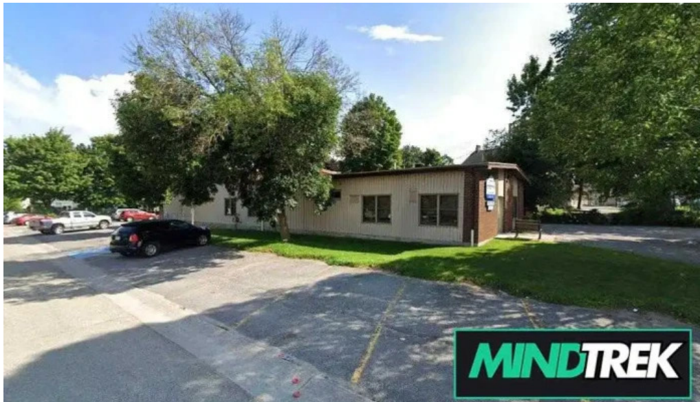
Movewell rehabilitation services gananoque