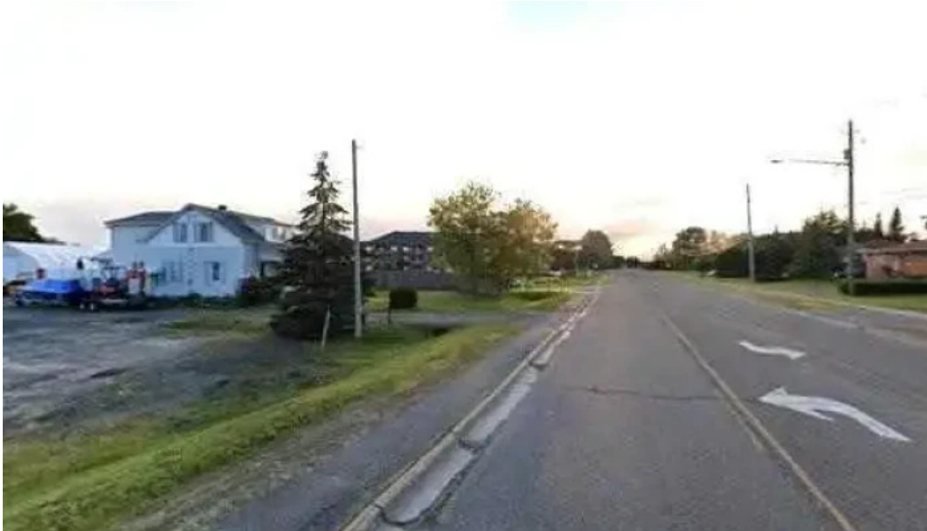
Movephysiotherapy street view 360deg