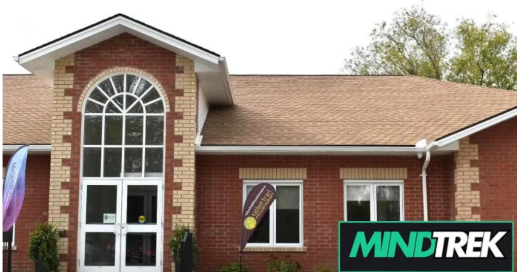
Talbot trail physiotherapy rehabilitation aymler