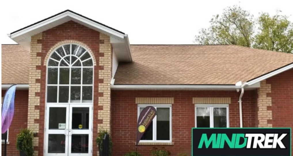
Talbot trail physiotherapy rehabilitation all