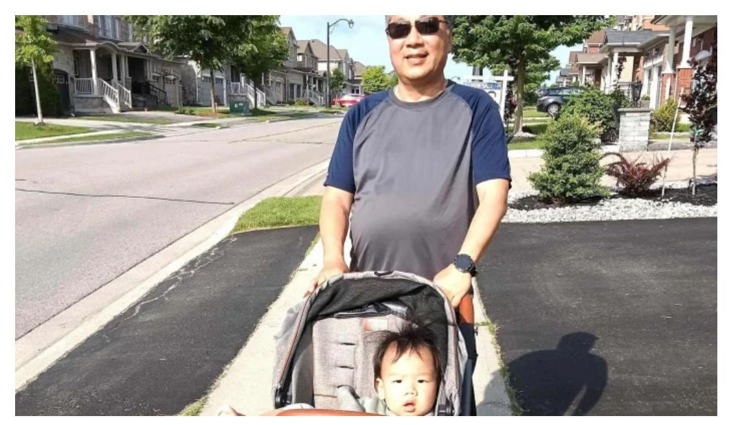
Momentum therapy physical therapist