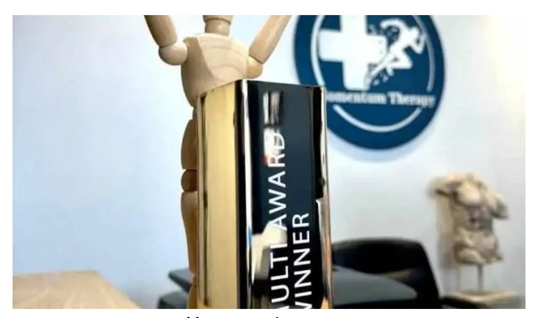
Momentum therapy aurora