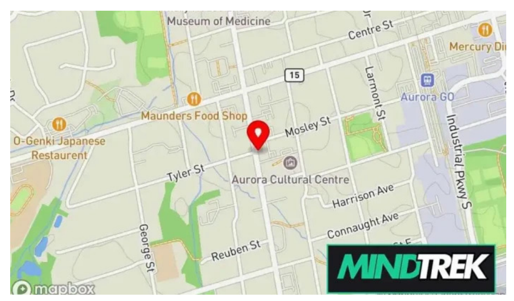
Momentum therapy map