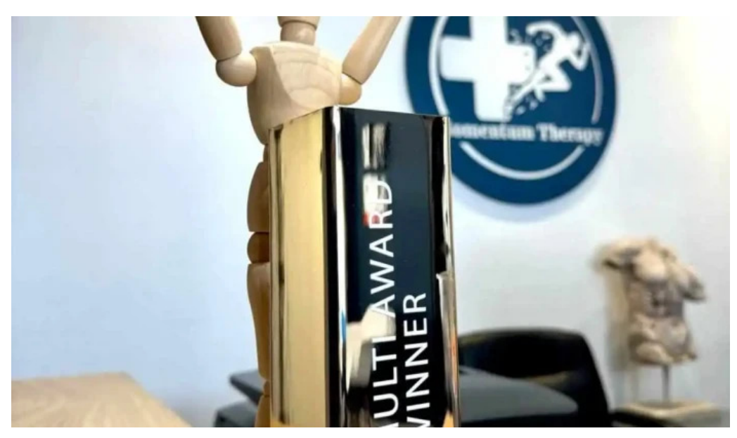
Momentum therapy all