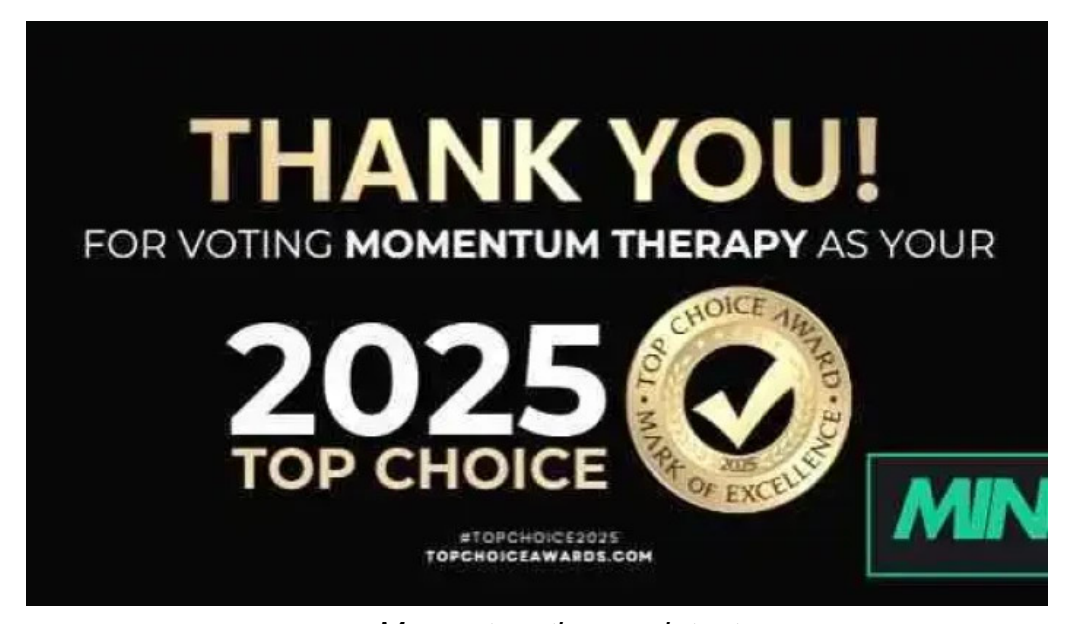
Momentum therapy latest