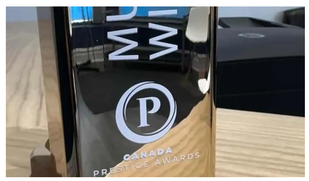
Momentum therapy videos