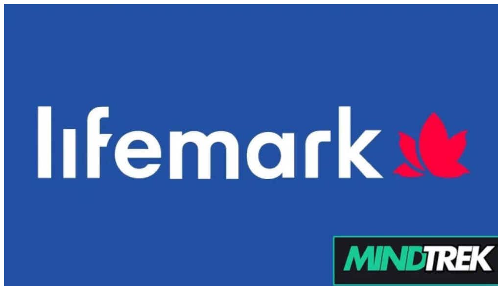
Lifemark physiotherapy aurora by owner