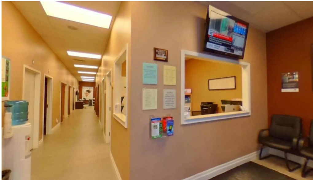
Lifemark physiotherapy aurora all