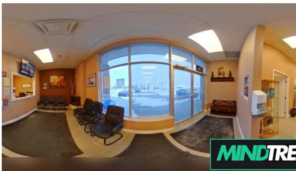
Lifemark physiotherapy aurora aurora