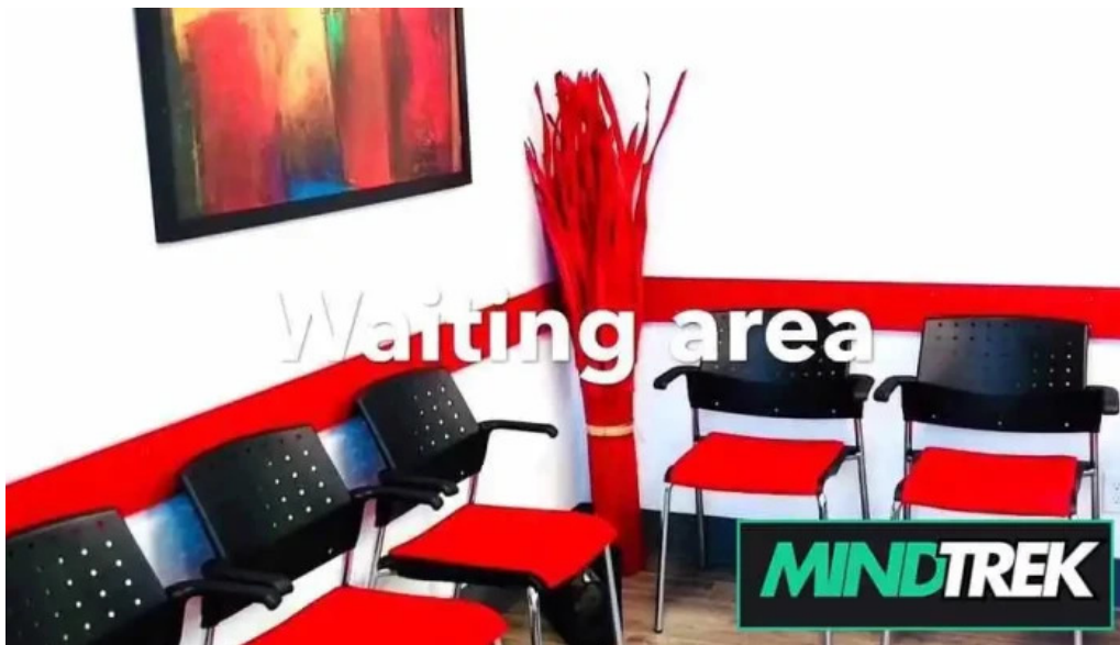
Sports medicine and rehabilitation angus videos