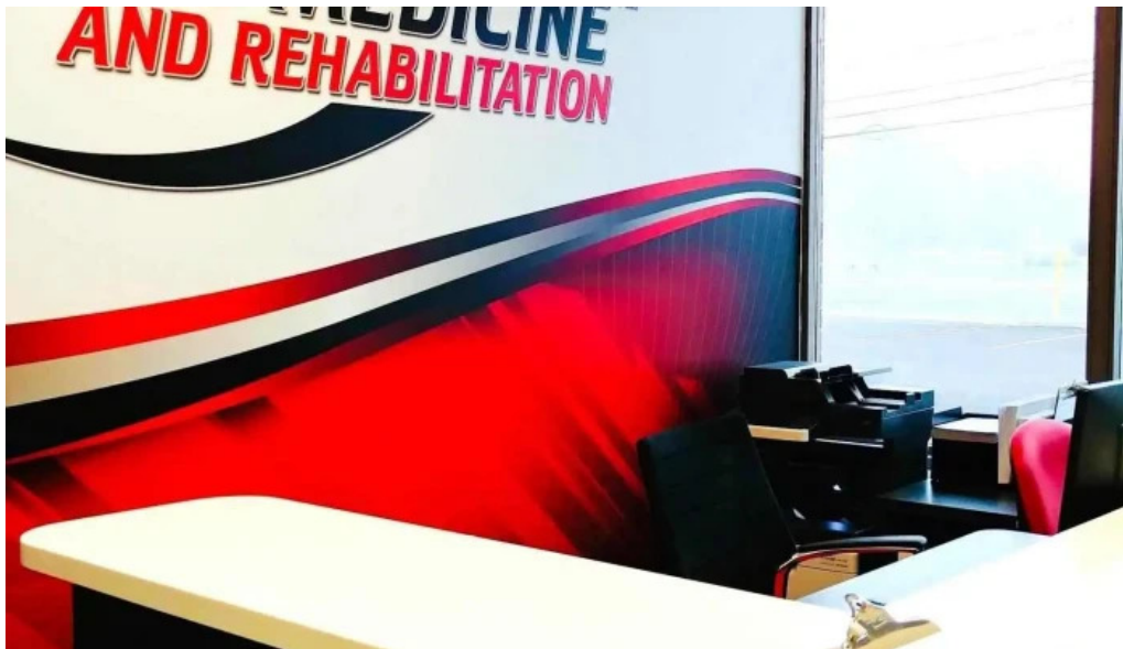
Sports medicine and rehabilitation angus all