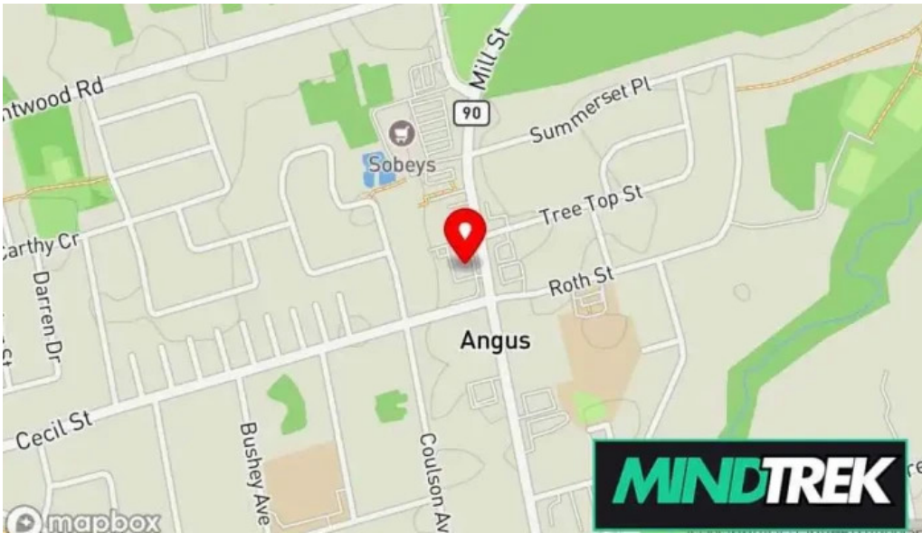
Sports medicine and rehabilitation angus map