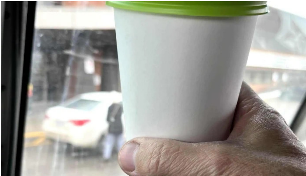
Sports medicine and rehabilitation angus physical therapist