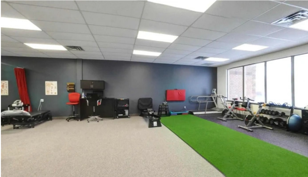
Sports medicine and rehabilitation angus street view 360deg