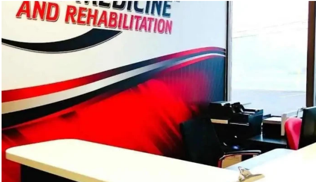
Sports medicine and rehabilitation angus angus