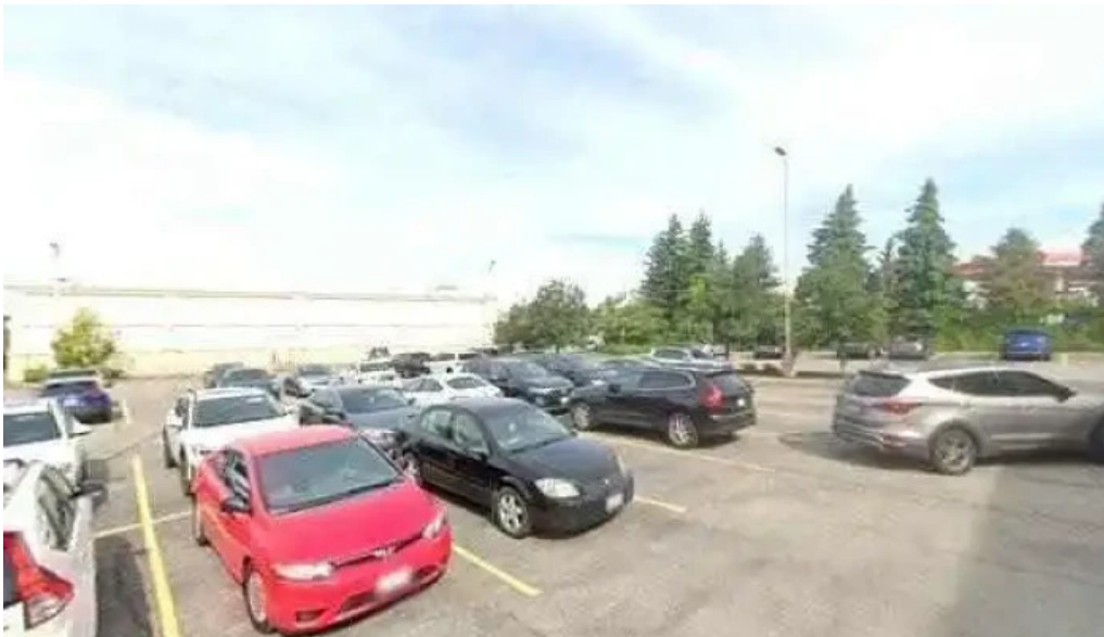
Wishbone athletics physiotherapy athletic therapy street view 360deg