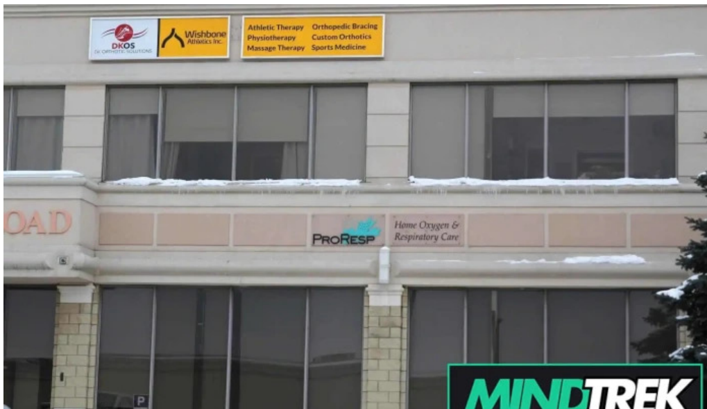
Wishbone athletics physiotherapy athletic therapy by owner