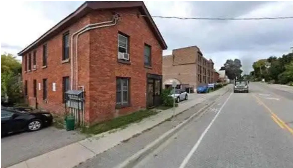
Melissa white fitnesspostpartum coach street view 360deg