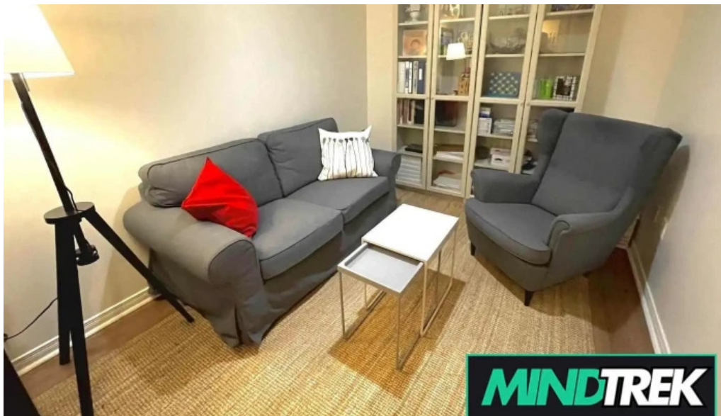
Voice of hope whitby