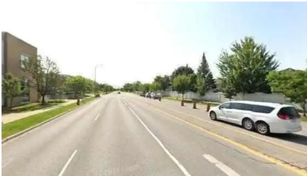
Voice of hope street view 360deg