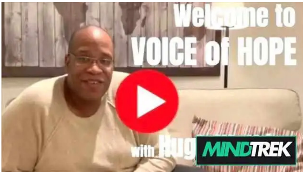
Voice of hope videos