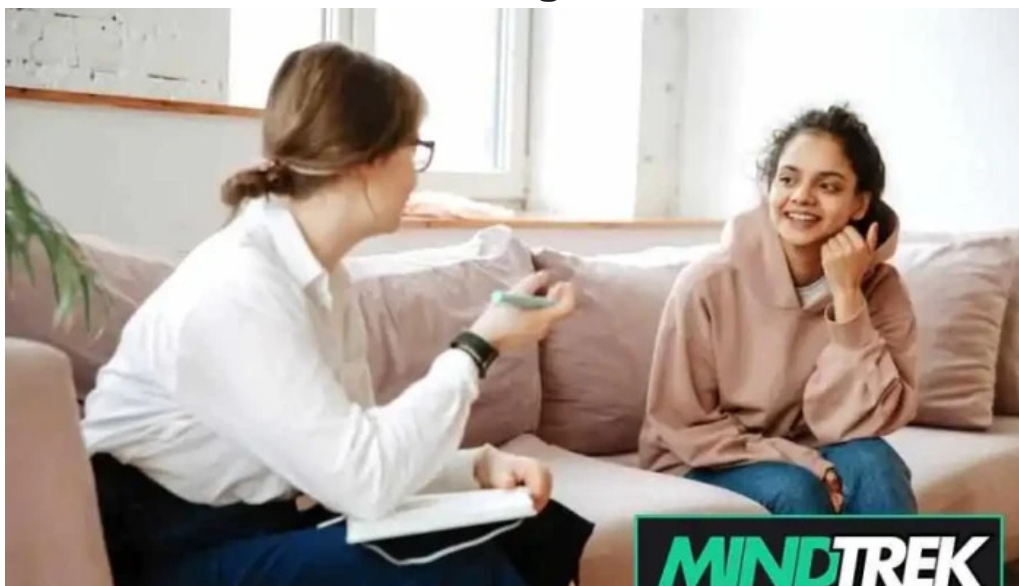
Pathways to emotional health inc whitby