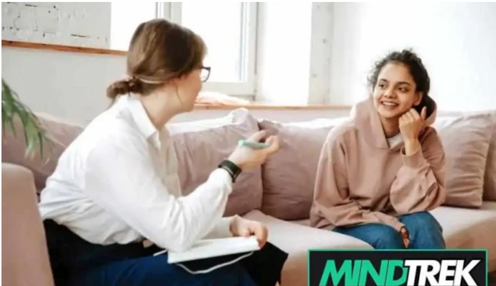
Pathways to emotional health inc all