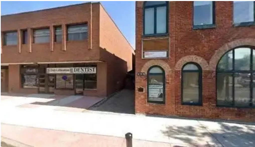
Pathways to emotional health inc street view 360deg