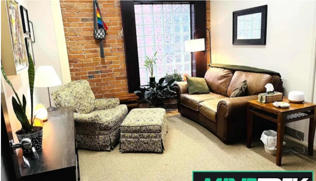
Pathways to emotional health inc by owner