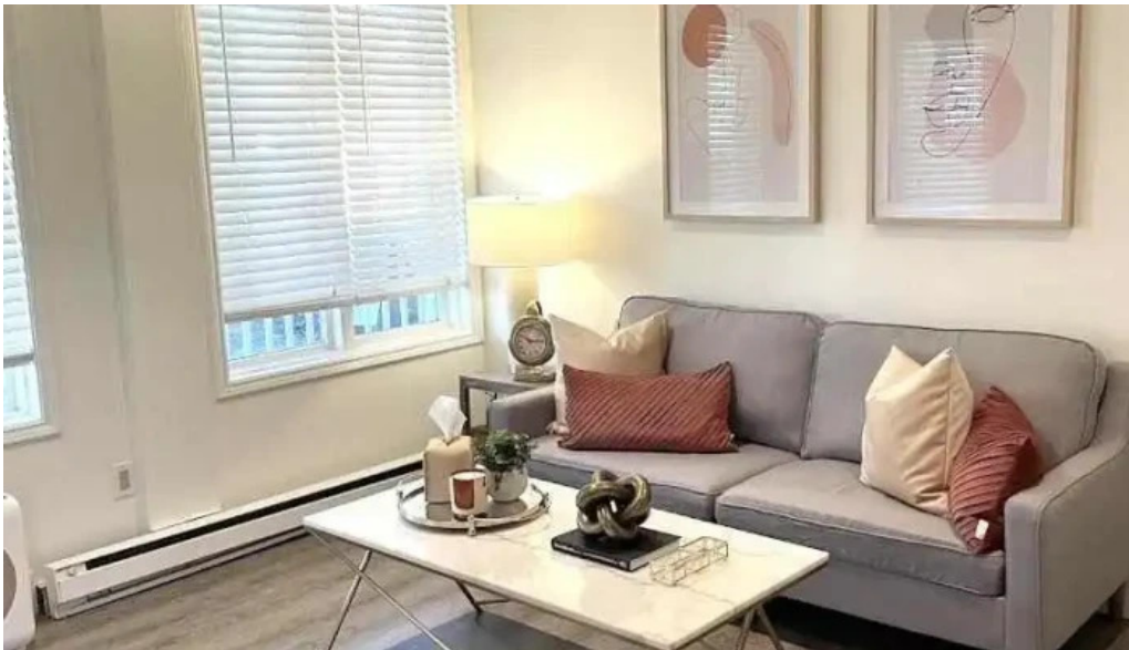
Lc psychotherapy whitby