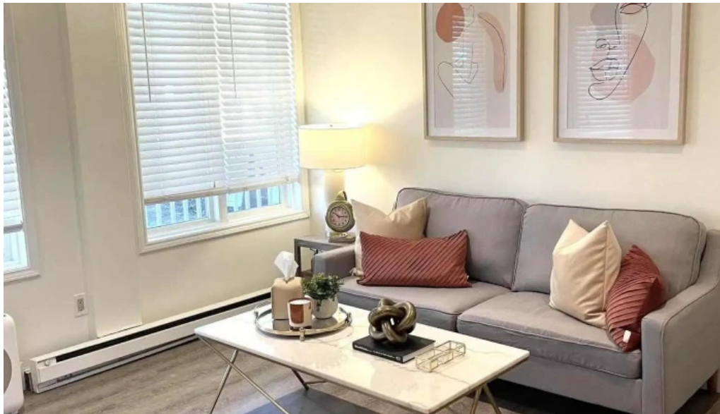
Lc psychotherapy all