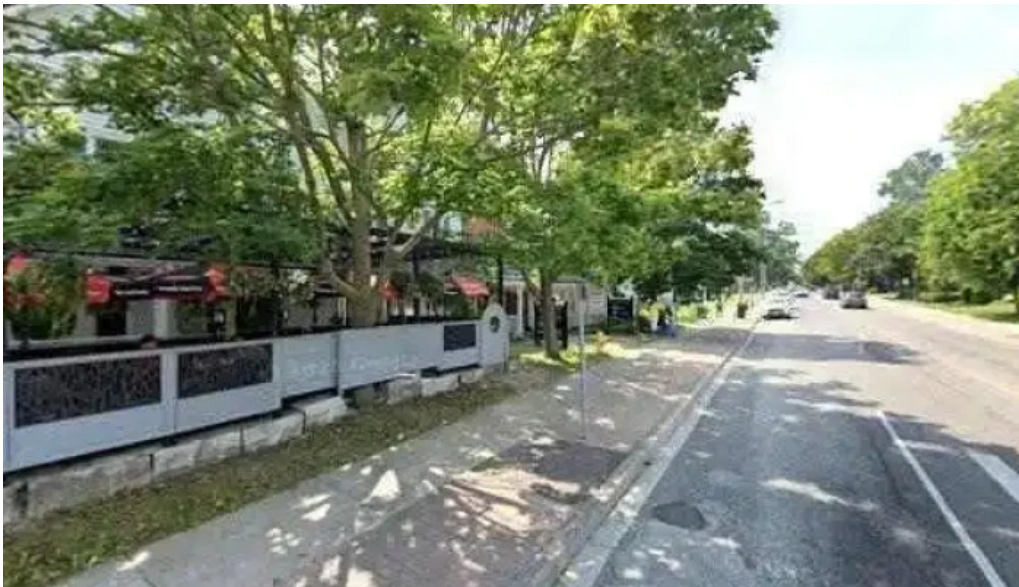
Lc psychotherapy street view 360deg