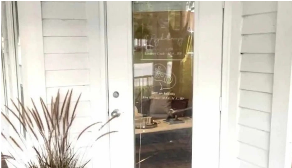
Lc psychotherapy by owner