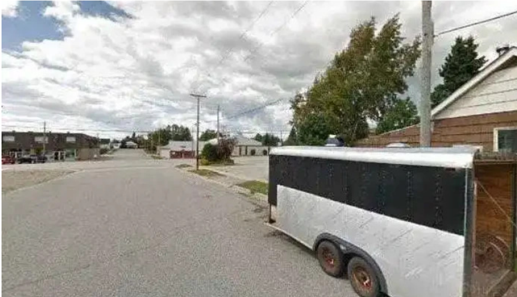
Algoma family services all