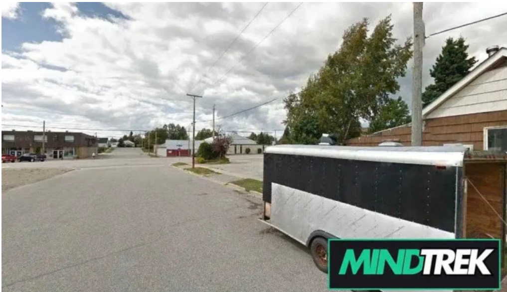
Algoma family services wawa