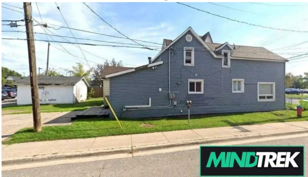
Canadian mental health association sault ste marie