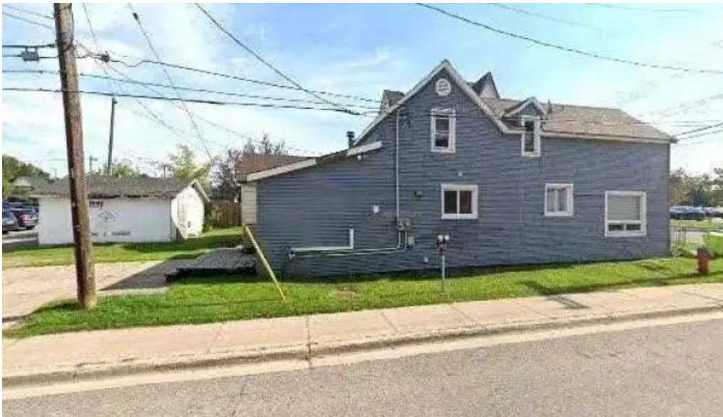
Canadian mental health association all