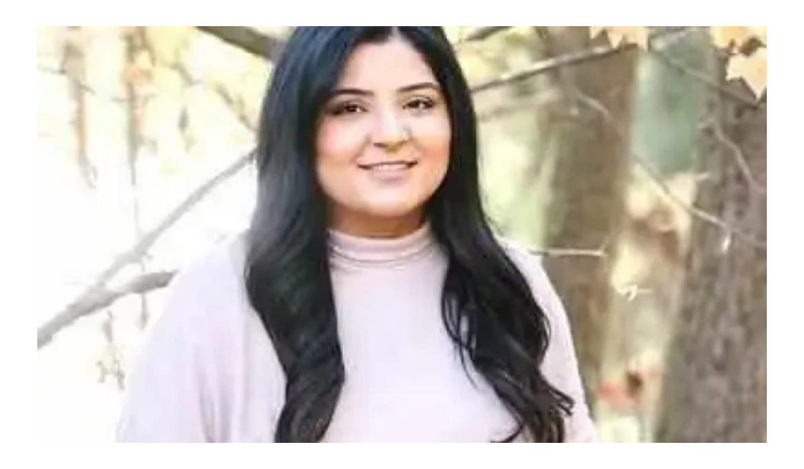
Mental Health Service In Ontario

https://www.mindtrek.ca/mental-health-service/ontario/inclusive-psychotherapy-ontario_352452.php