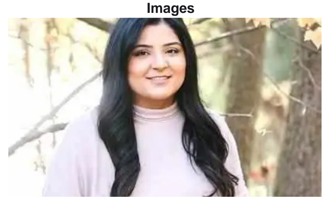
Inclusive psychotherapy ontario

If you wish to adjust any element that you feel is incorrect related to this page, we ask send us a message so we can we will fix it quickly. Thank you in advance thanks for your cooperation.