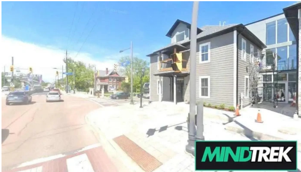
She psychotherapy newmarket