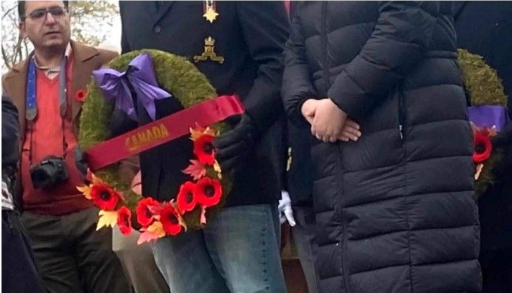
Cadence health wellness inc area