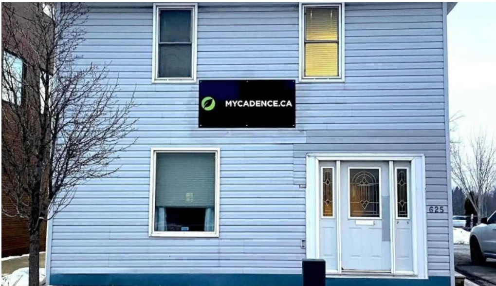
Cadence health wellness inc all