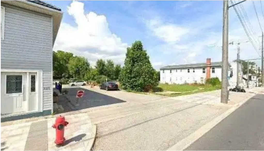
Cadence health wellness inc street view 360deg