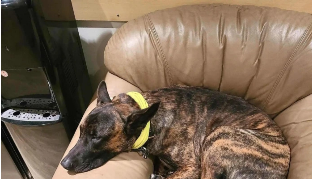
Cadence health wellness inc newmarket