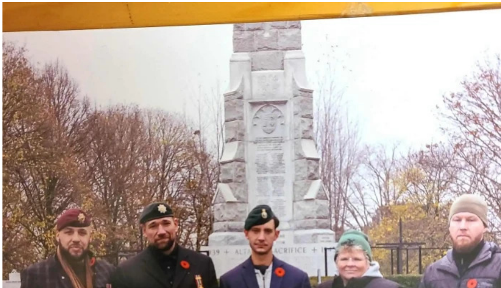
Cadence health wellness inc catalog