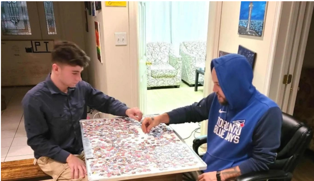
Cadence health wellness inc prices