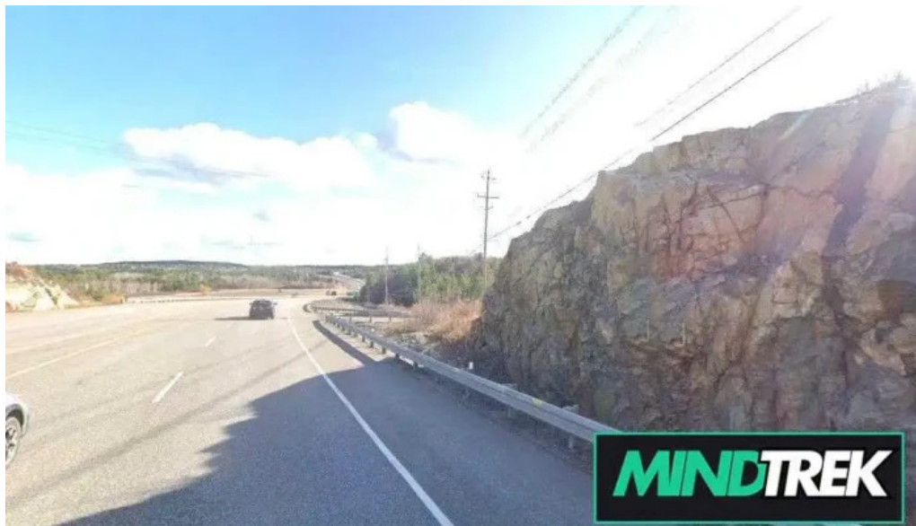
Living potential hanmer