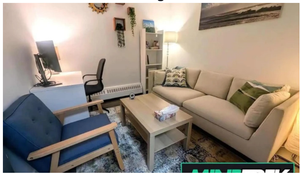
South etobicoke therapy etobicoke