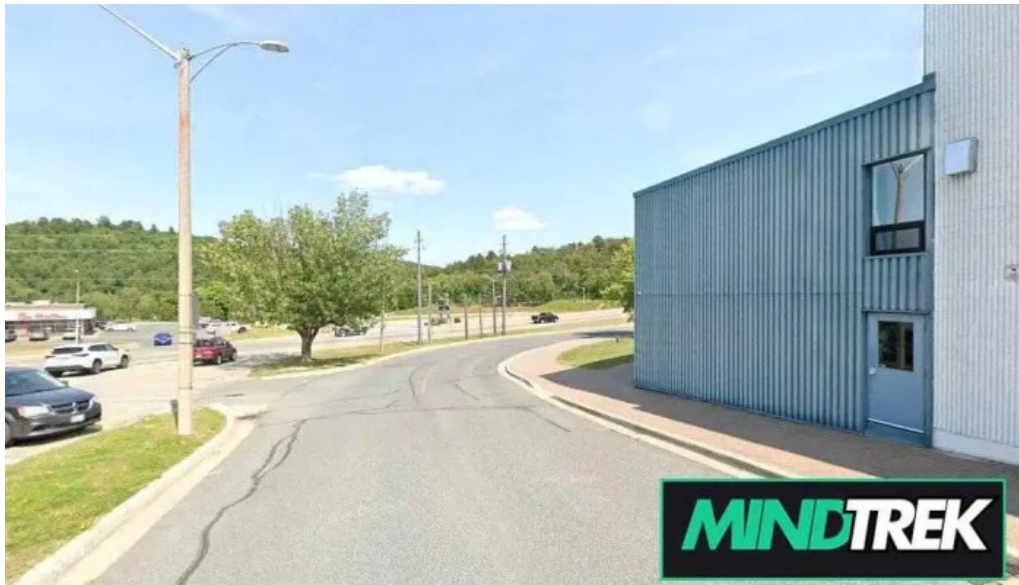
Algoma family services elliot lake