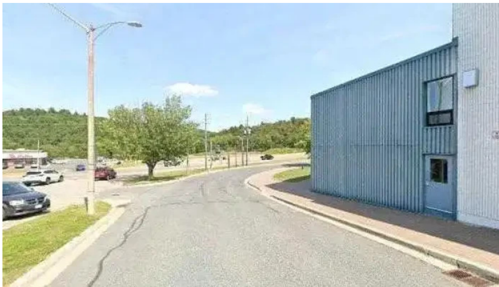
Algoma family services all