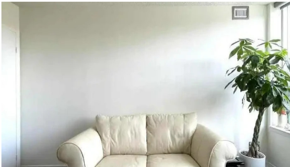
Fairbank therapy east york