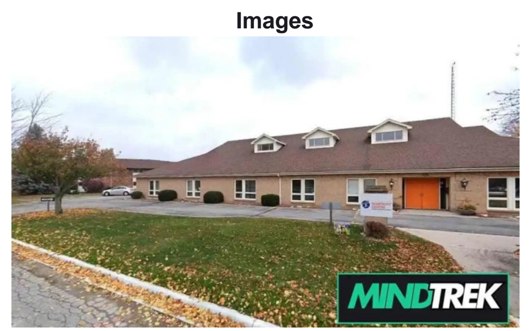
Relanding psychological services chatham

If you wish to adjust any detail that you believe is not precise regarding this page, we urge you to deliver a message so that we will correct it at the earliest convenience. Thank you in advance thanks for your cooperation.