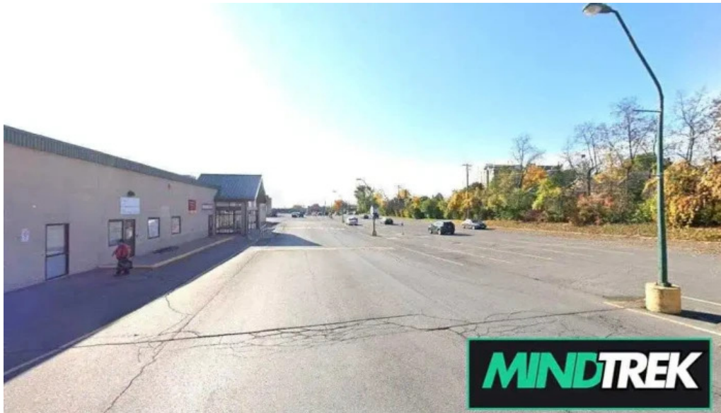
Dual diagnosis consultation outreach team belleville belleville