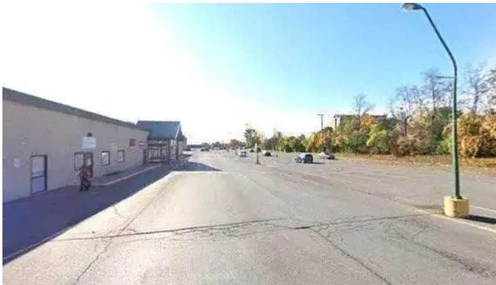
Dual diagnosis consultation outreach team belleville all