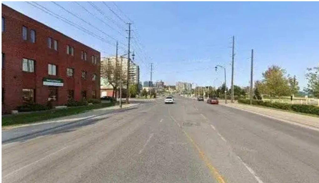
Kinark child and family services all