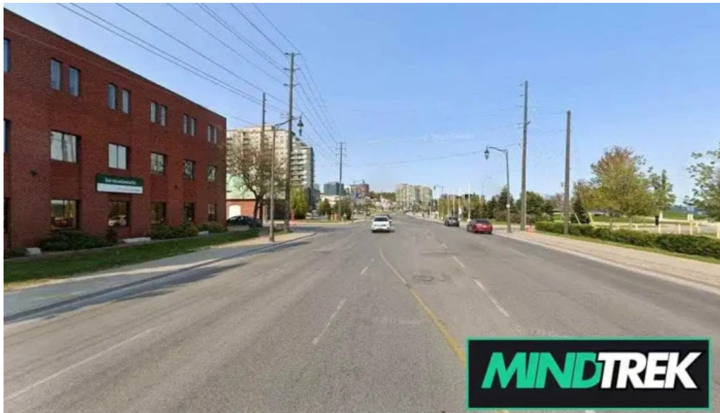
Kinark child and family services barrie