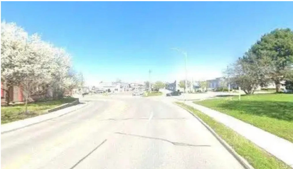
Psychability child and adolescent psychological services all