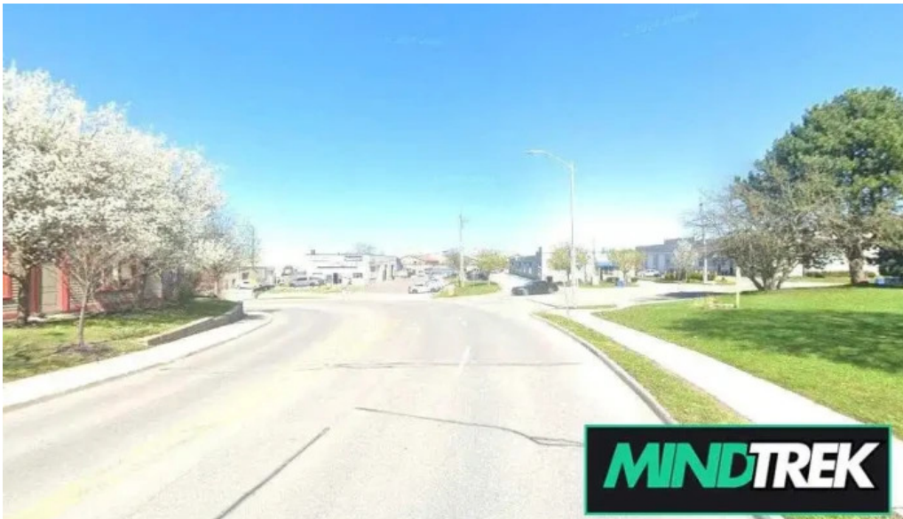
Psychability child and adolescent psychological services aurora