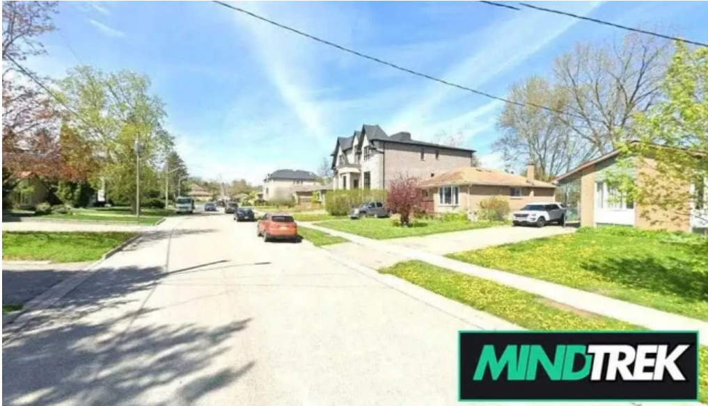
Neuro vagal mindfulness aurora