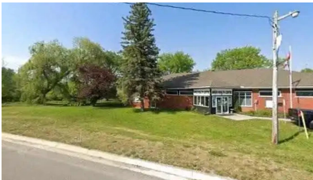
Major psychotherapy all