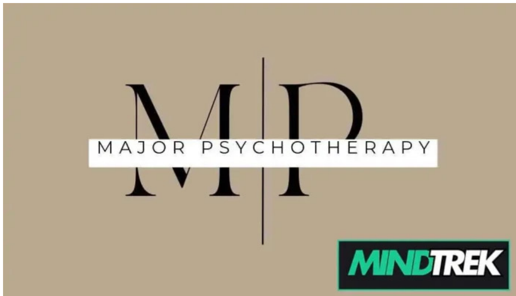
Major psychotherapy by owner