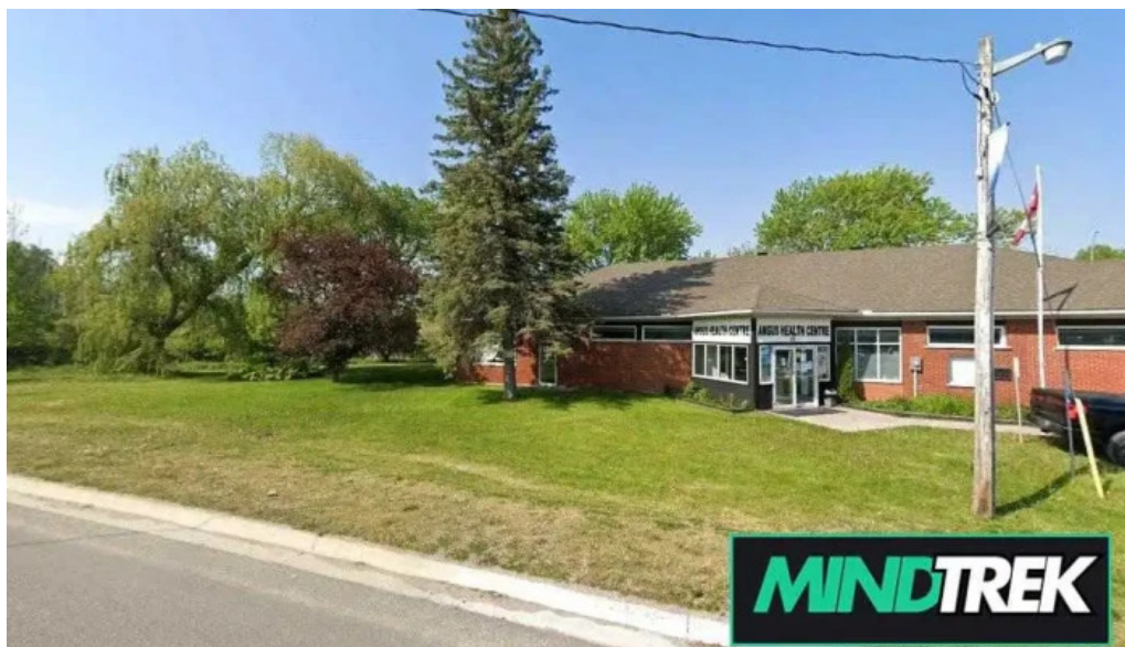
Major psychotherapy angus