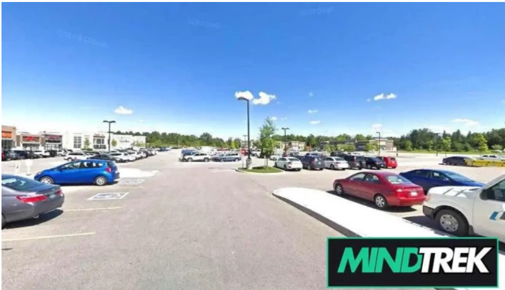
Integrate health services ajax