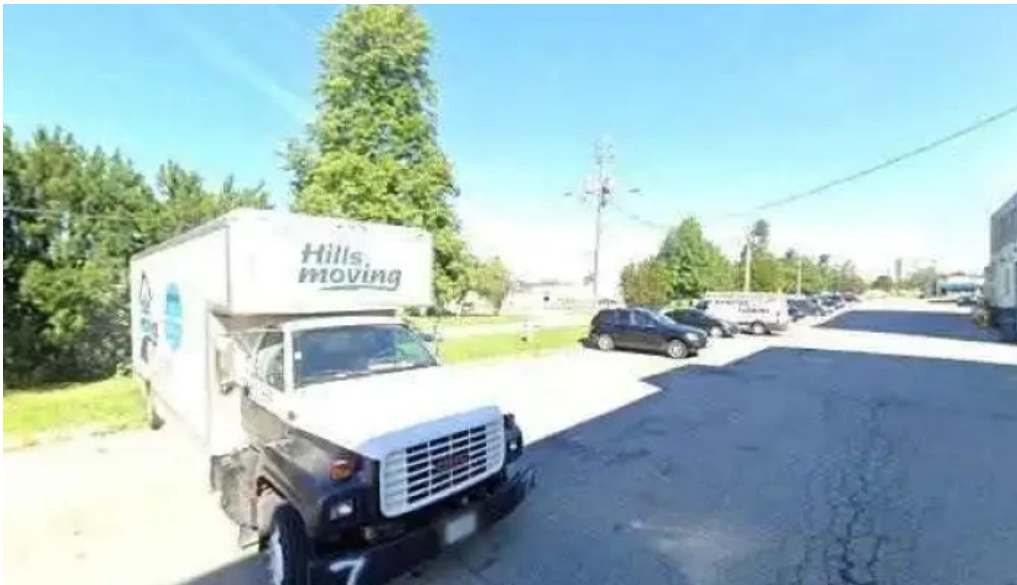
In time counselling consulting services all