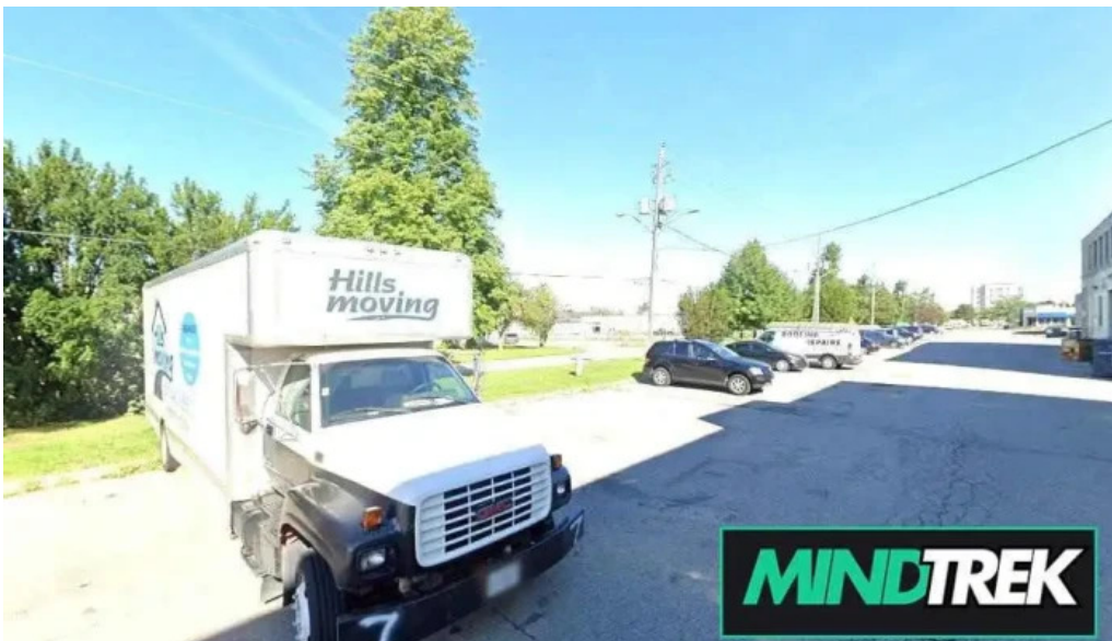
In time counselling consulting services ajax