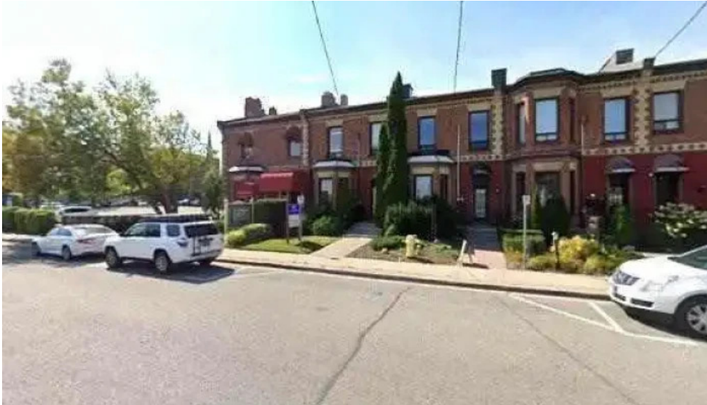
The insight clinic all