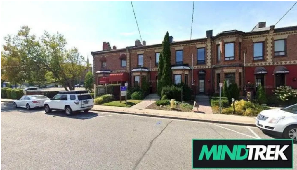
The insight clinic whitby