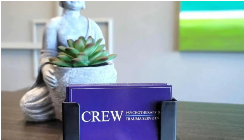
Crew psychotherapy and trauma services all