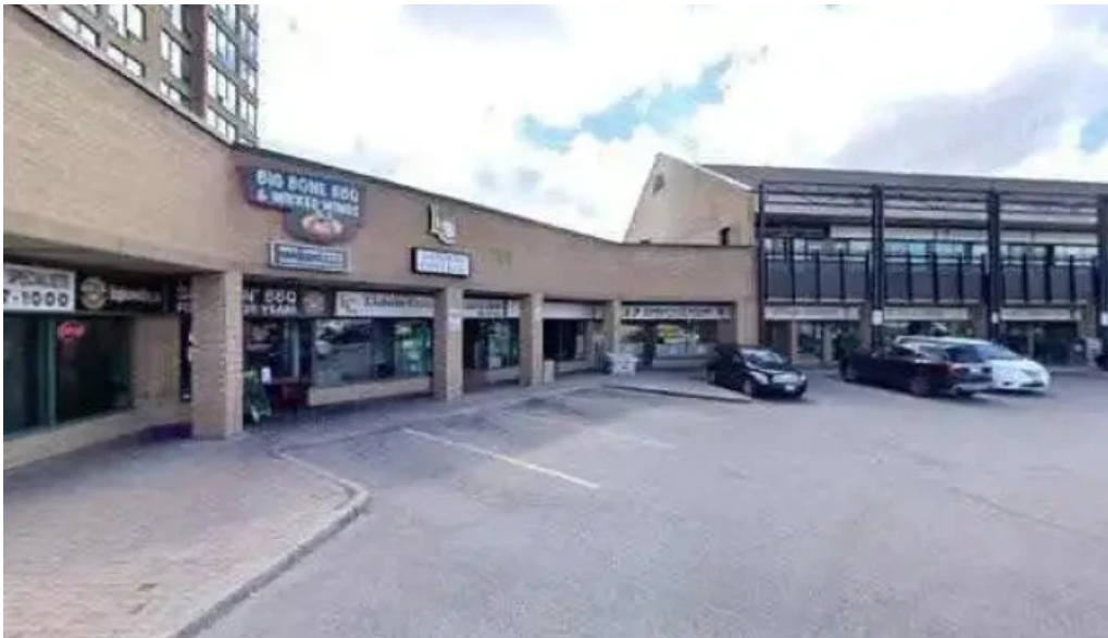
Crew psychotherapy and trauma services street view 360deg