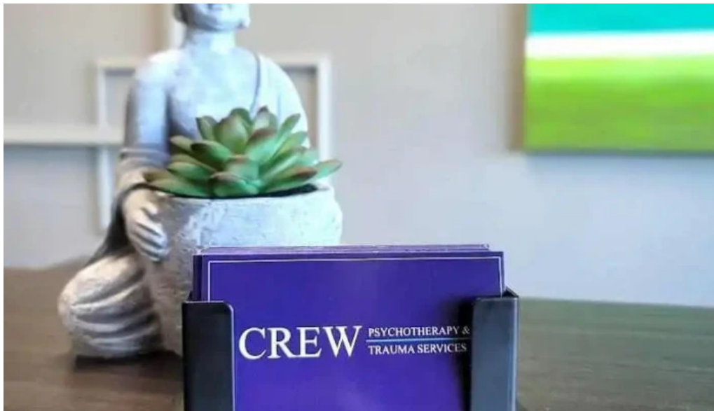
Crew psychotherapy and trauma services whitby