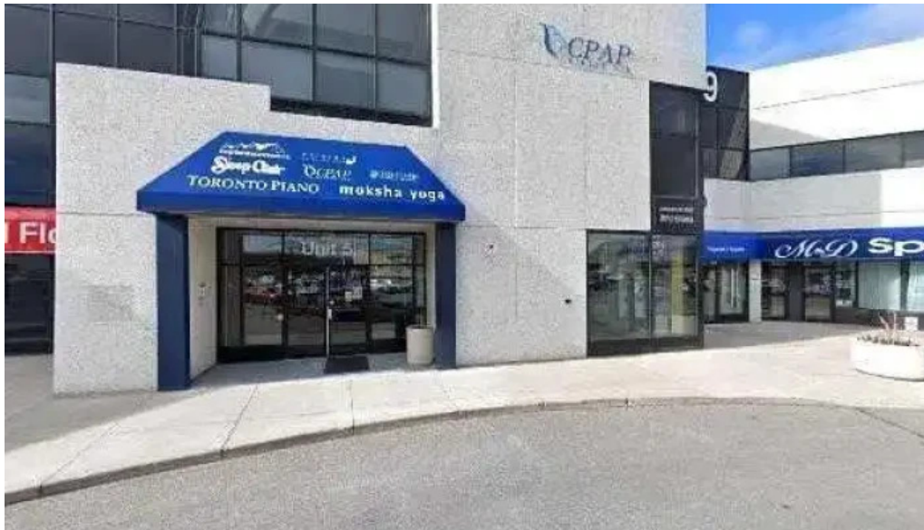
Focus and function clinic all