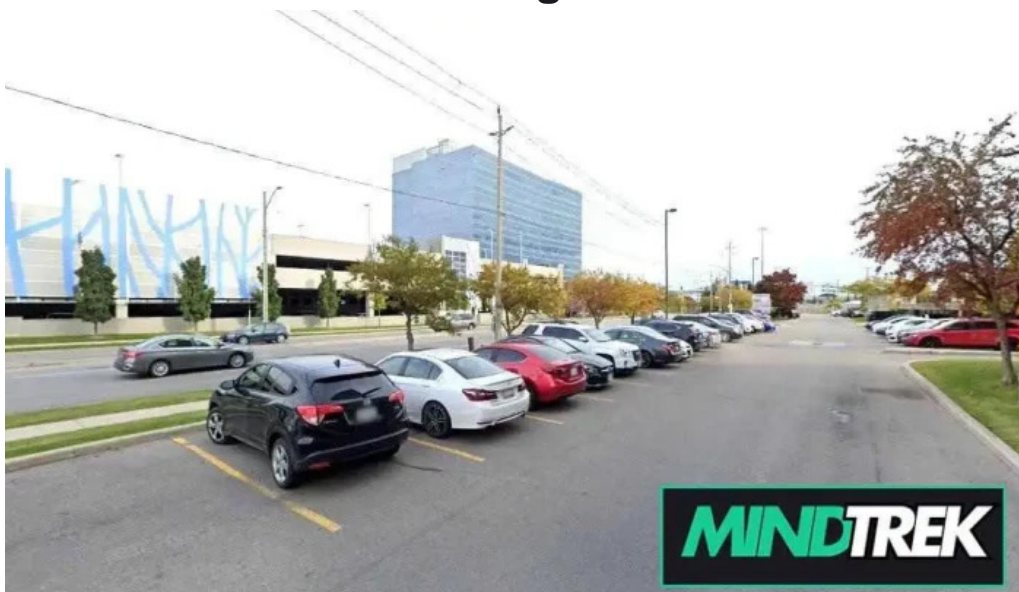
Clear mind therapy pickering