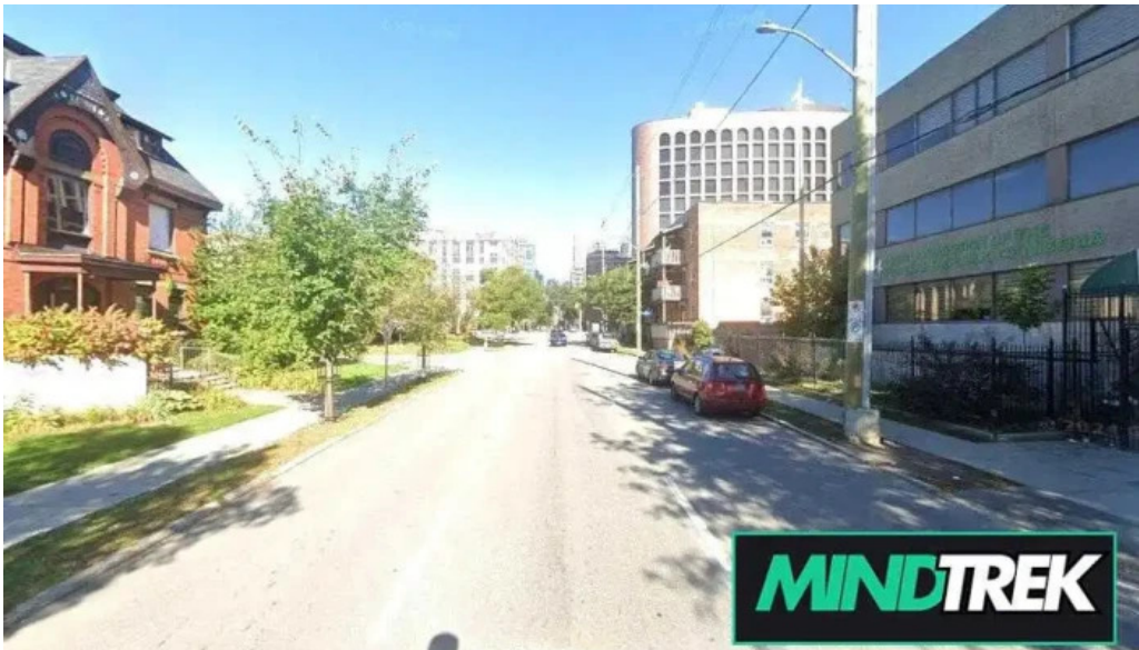
Centretown psychotherapy ottawa

If necessary to adjust any data that you think is incorrect regarding this web, please deliver a message so we can we will handle it as soon as possible. In advance thanks.