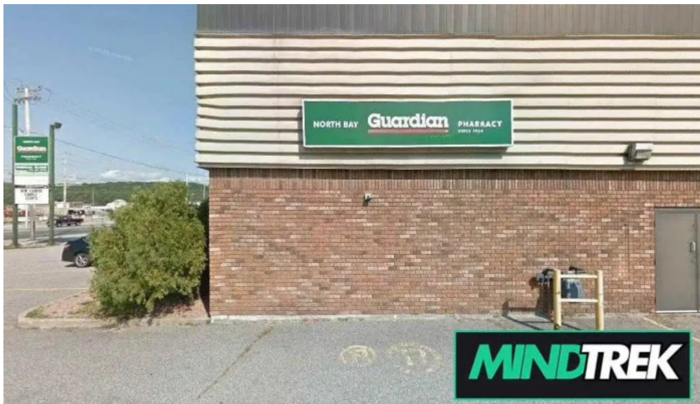
Headway clinic north bay