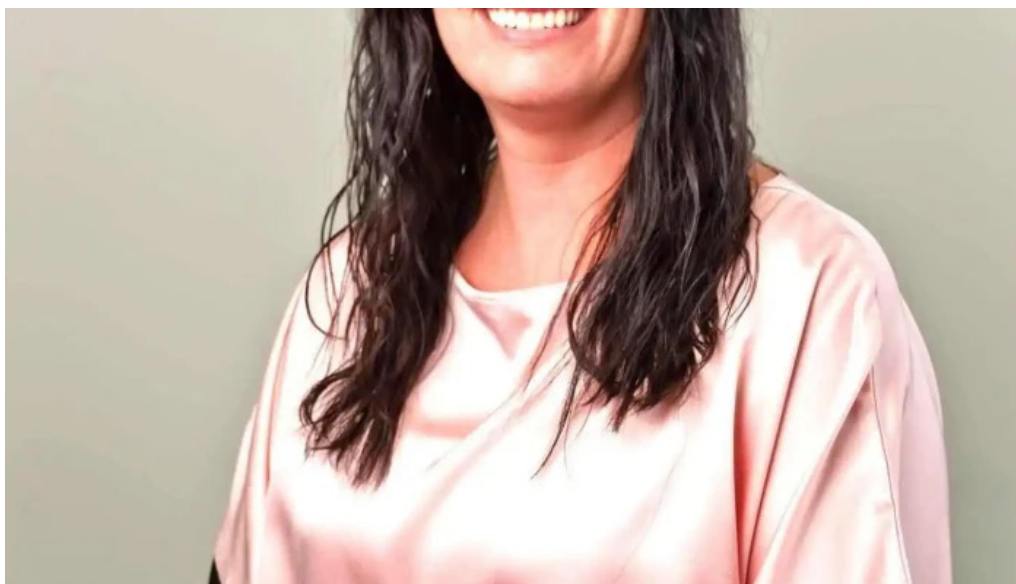
Headway clinic by owner