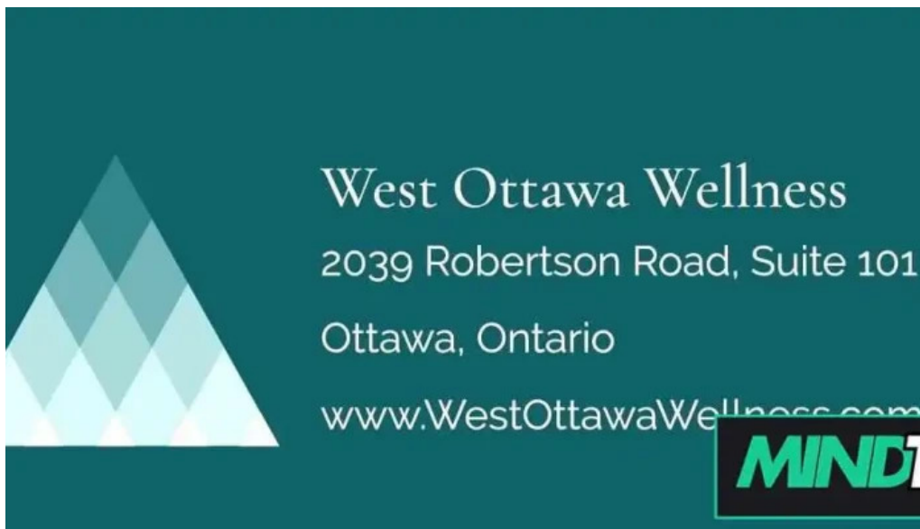
West ottawa wellness nepean