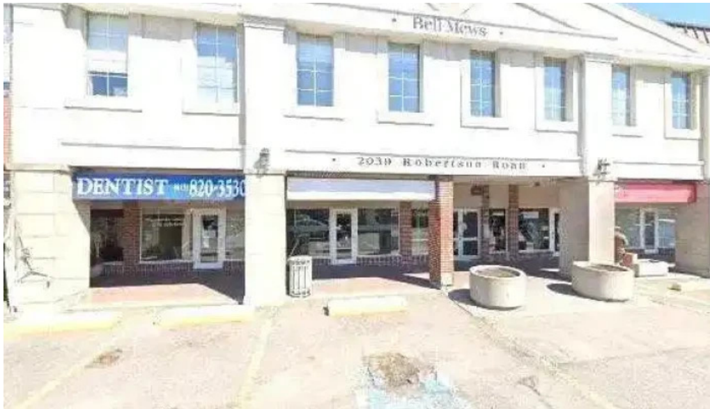
West ottawa wellness street view 360deg