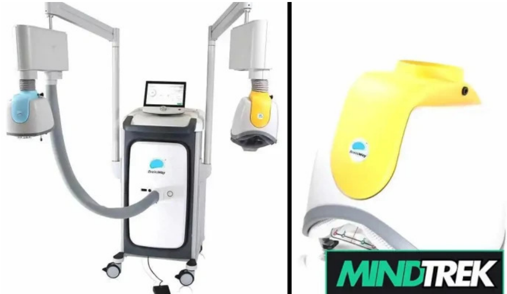
Headway clinic by owner