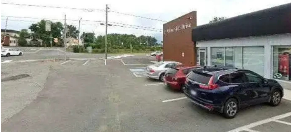
Headway clinic all