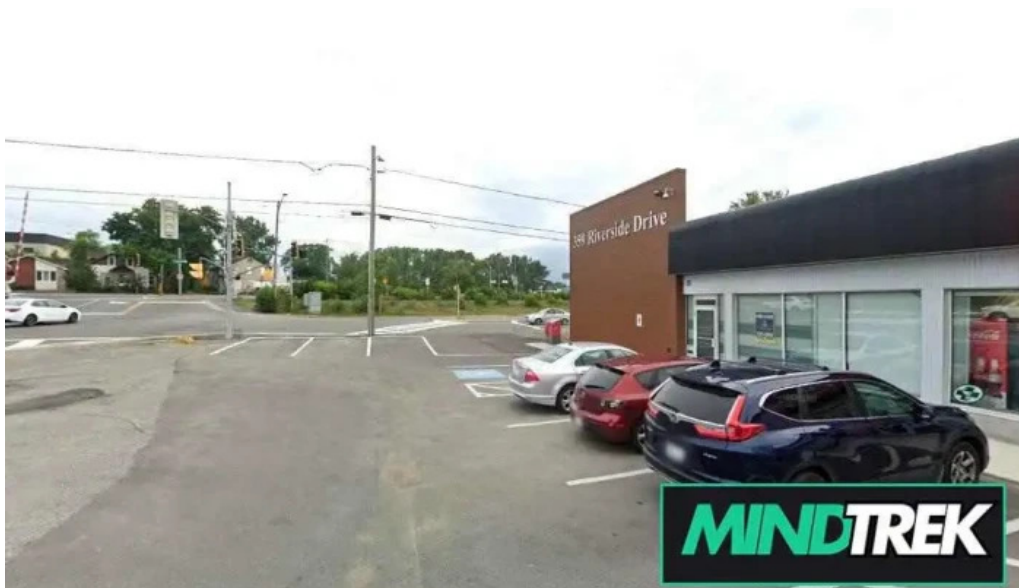
Headway clinic greater sudbury