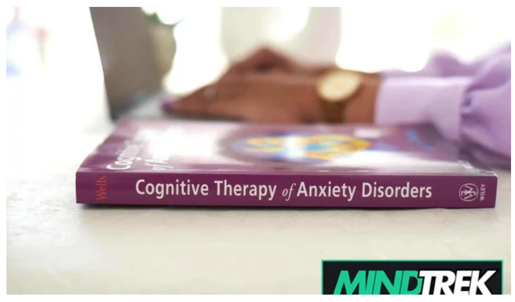
The wise self psychotherapy clinic etobicoke