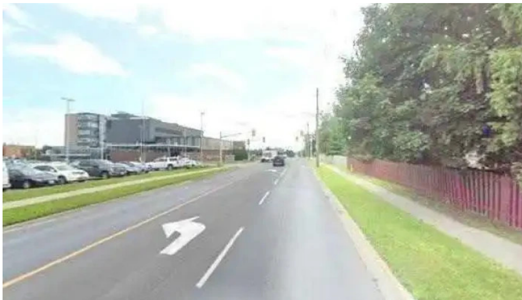
Child and youth mental health services cornwall hospital all