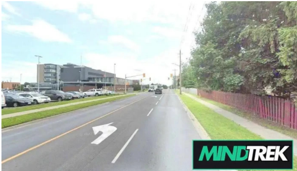
Child and youth mental health services cornwall hospital cornwall