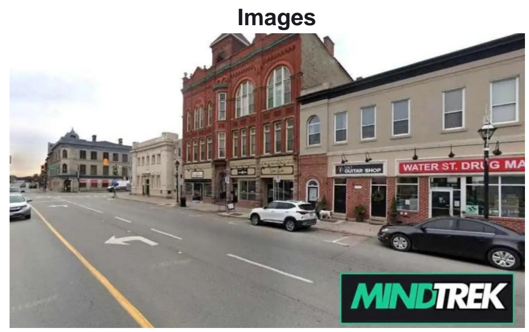
Connecting in rhythm cambridge

If you need to adjust any data that you believe is not correct concerning this site, we ask deliver a message so we can we will handle it promptly. With anticipation thanks for your cooperation.