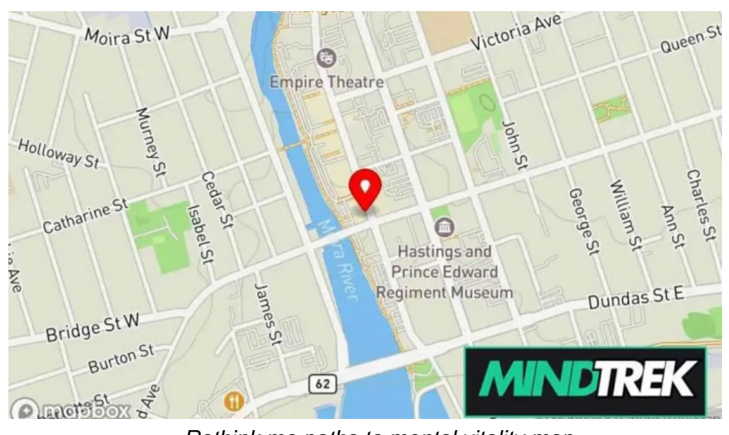
Rethink me paths to mental vitality map