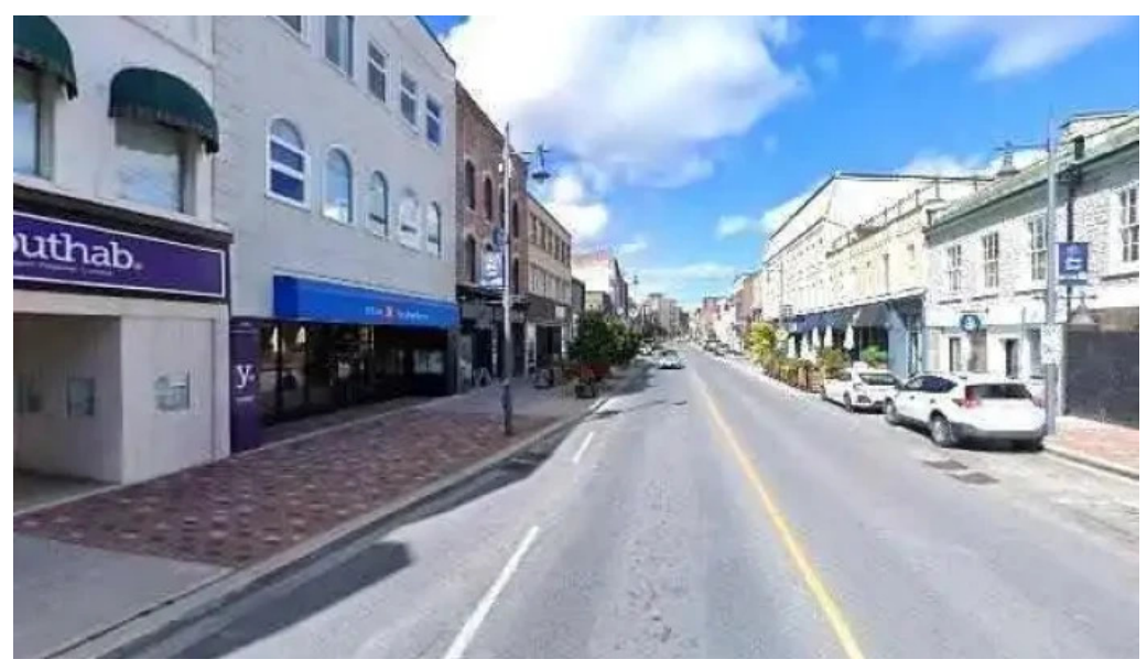
Rethink me paths to mental vitality street view 360deg