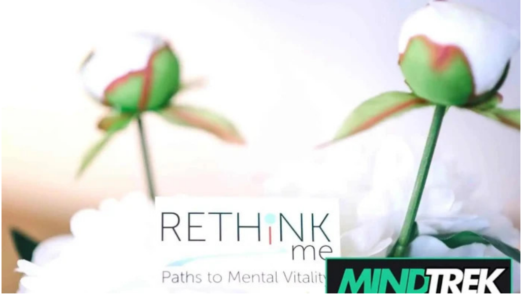
Rethink me paths to mental vitality belleville