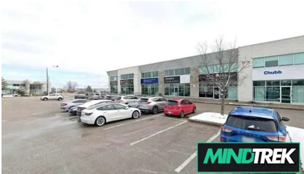
Mackenzie health centre for behaviour health sciences barrie