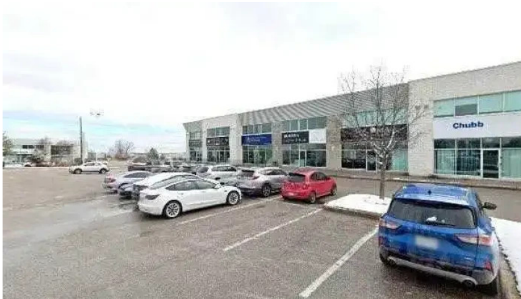
Mackenzie health centre for behaviour health sciences all