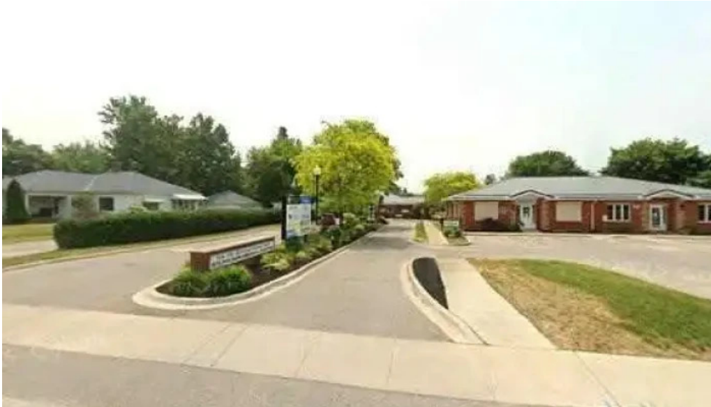
Canadian mental health assn all