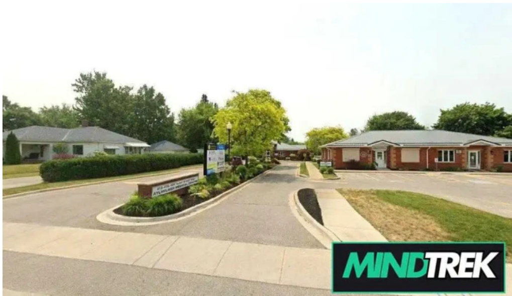
Canadian mental health assn aylmer