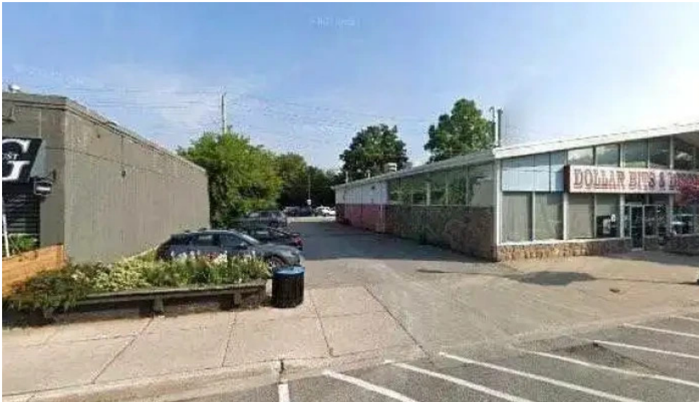
Simcoe county addiction mental health service all