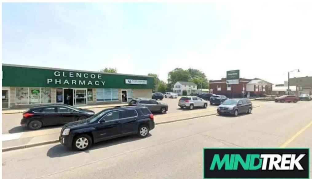
Four counties family health team glencoe