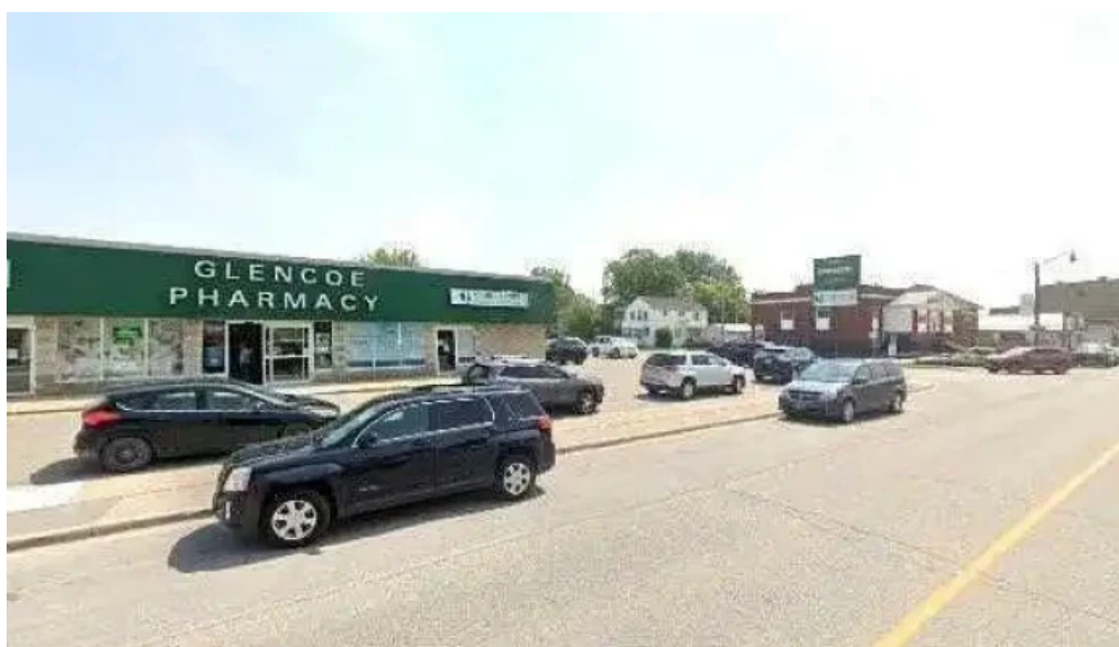
Four counties family health team all