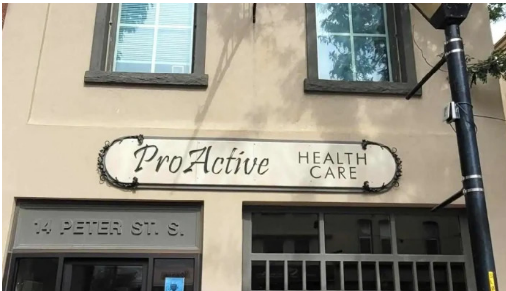
Proactive health care all