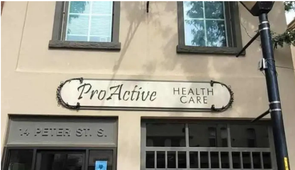
Proactive health care orillia