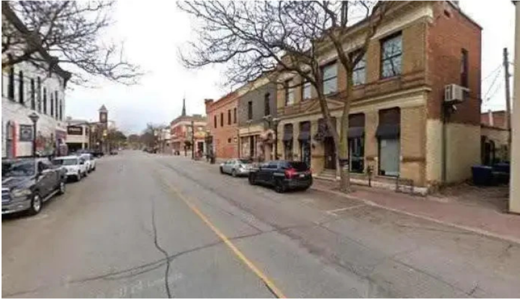
Proactive health care street view 360deg