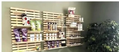
Limestone therapies all