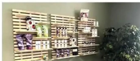
Limestone therapies kingston