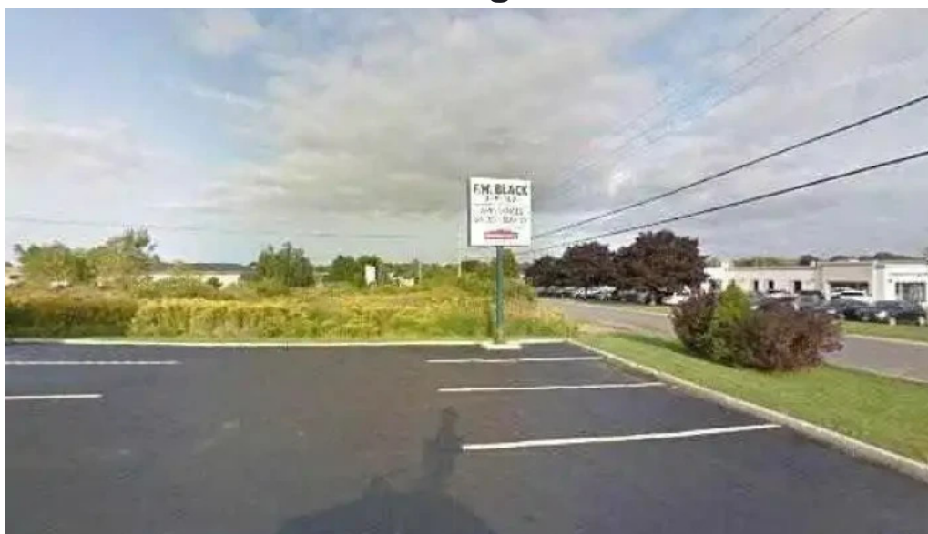
Limestone therapies street view 360deg