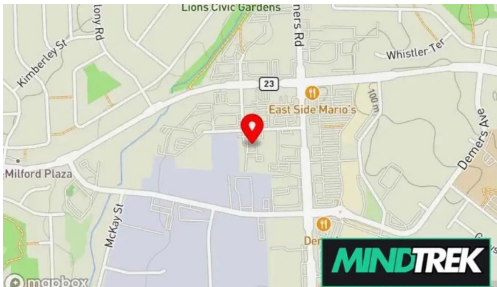
Limestone therapies map