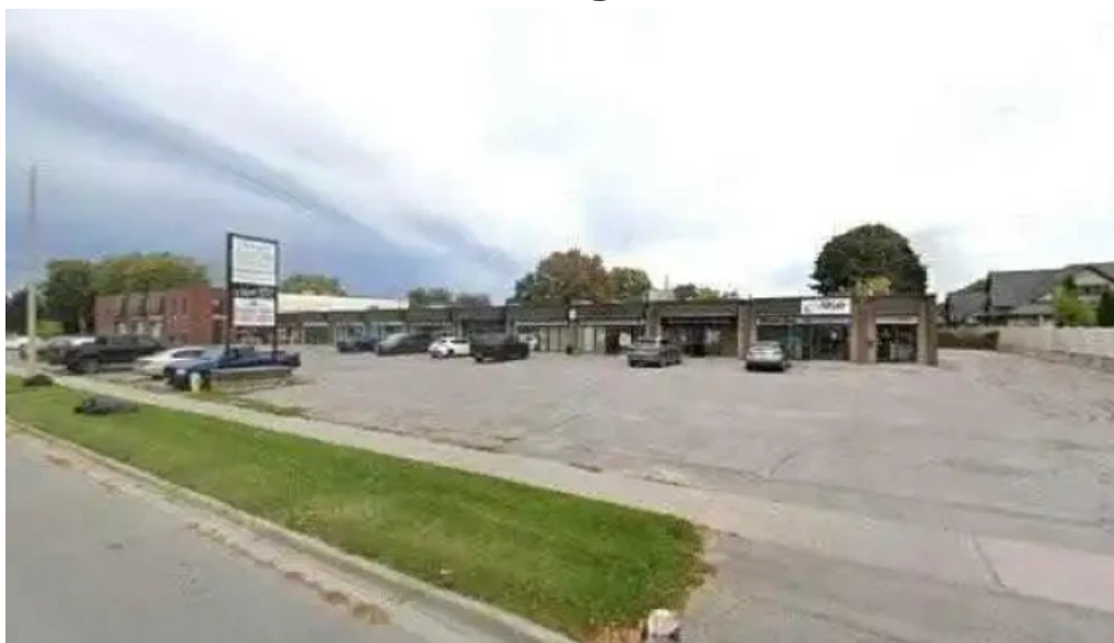
Movewell belleville street view 360deg