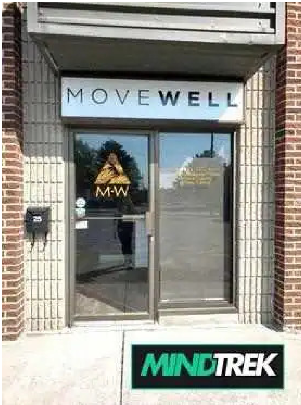
Movewell belleville by owner