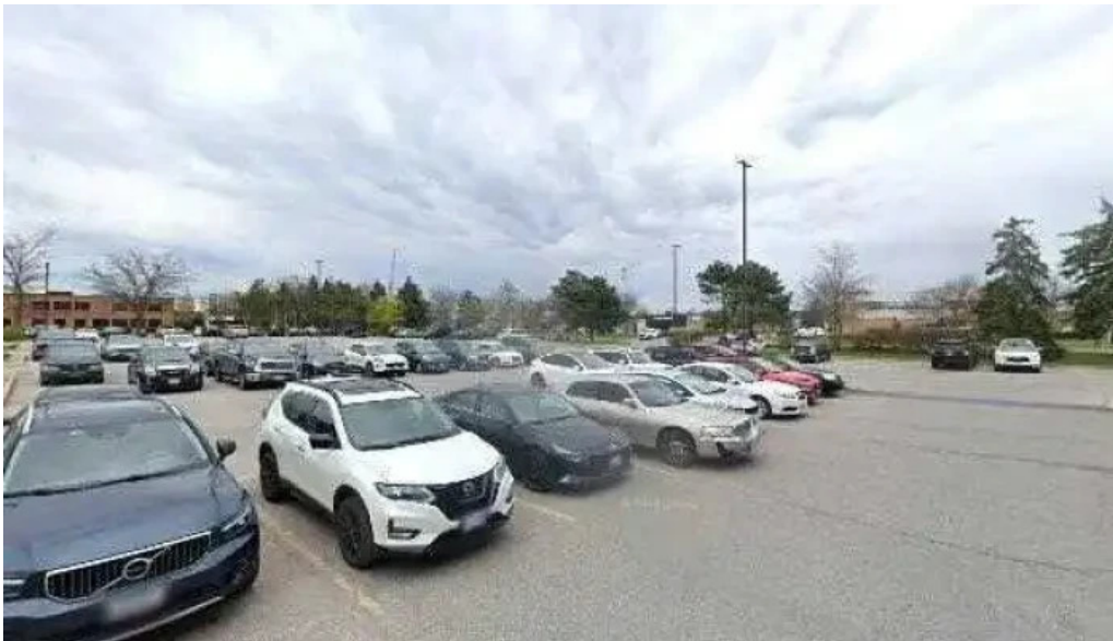
Angela colangelo counselling services street view 360deg