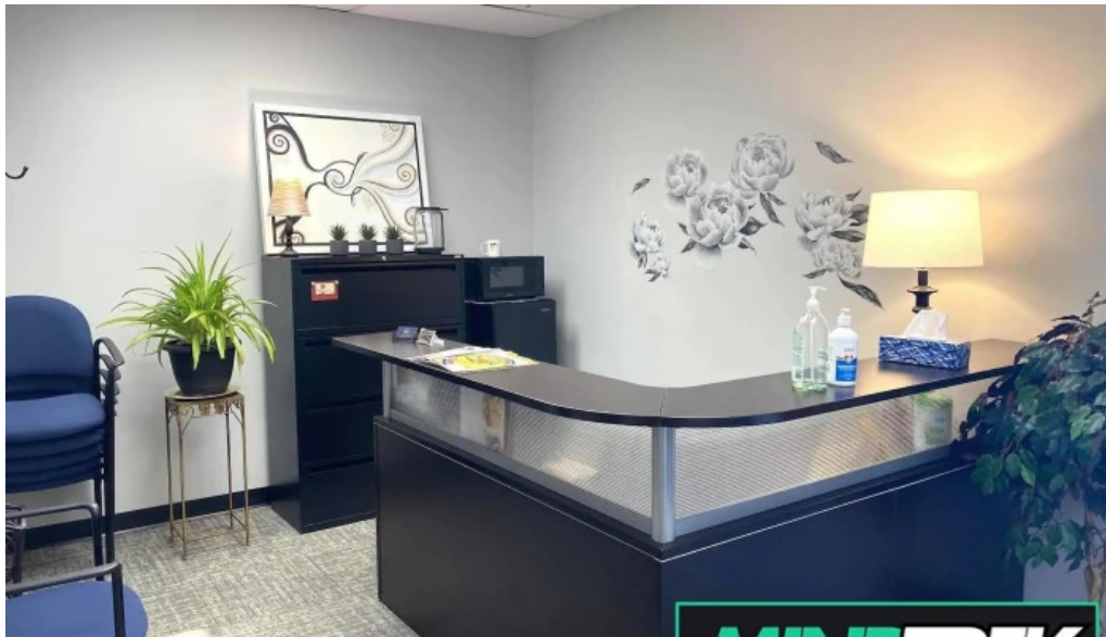
Angela colangelo counselling services all