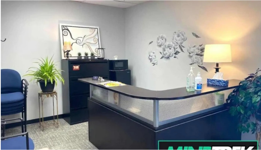
Angela colangelo counselling services whitchurch stouffville