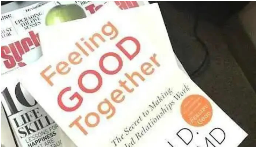
Harmony counsellings by owner