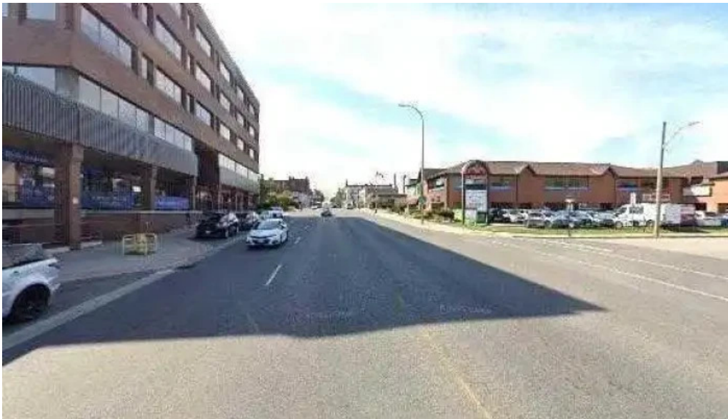
Harmony counsellings street view 360deg