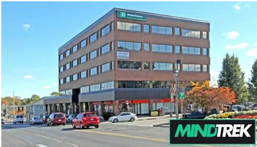
Harmony counsellings whitby